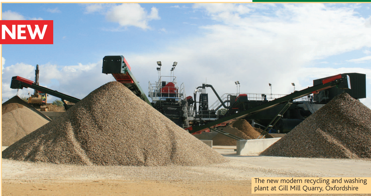
The new modern recycling and washing plant at Gill Mill Quarry, Oxfordshire