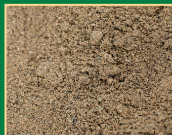
Washed and recycled sharp sand