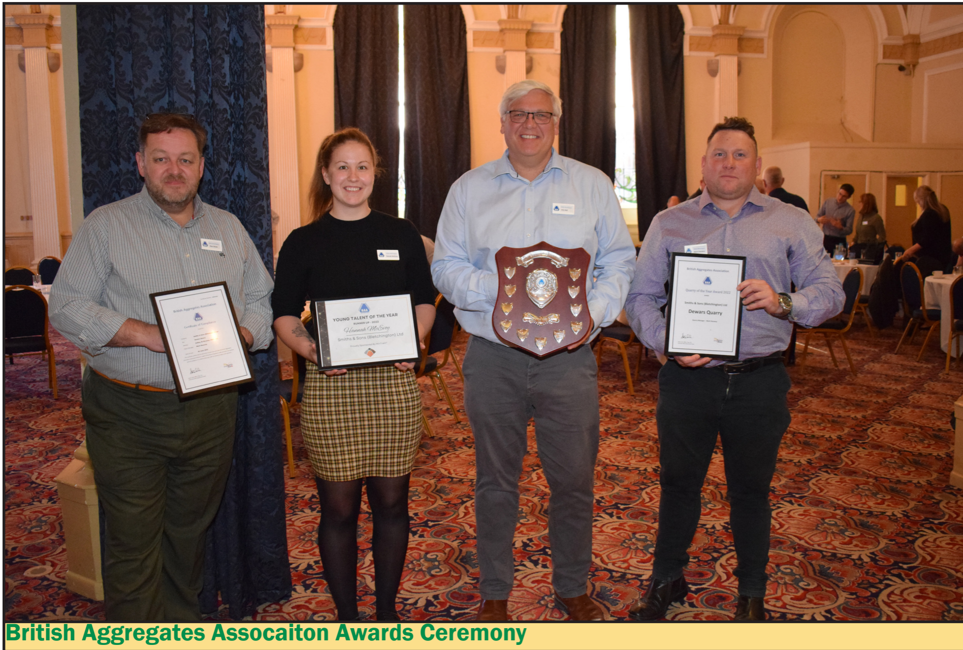
British Aggregates Association Awards Ceremony

Dewars Farm Quarry has recently been awarded Quarry of the Year 2022 by the British Aggregates Association for it's high operating standards - this is the second year in a row that Smiths has won this award.