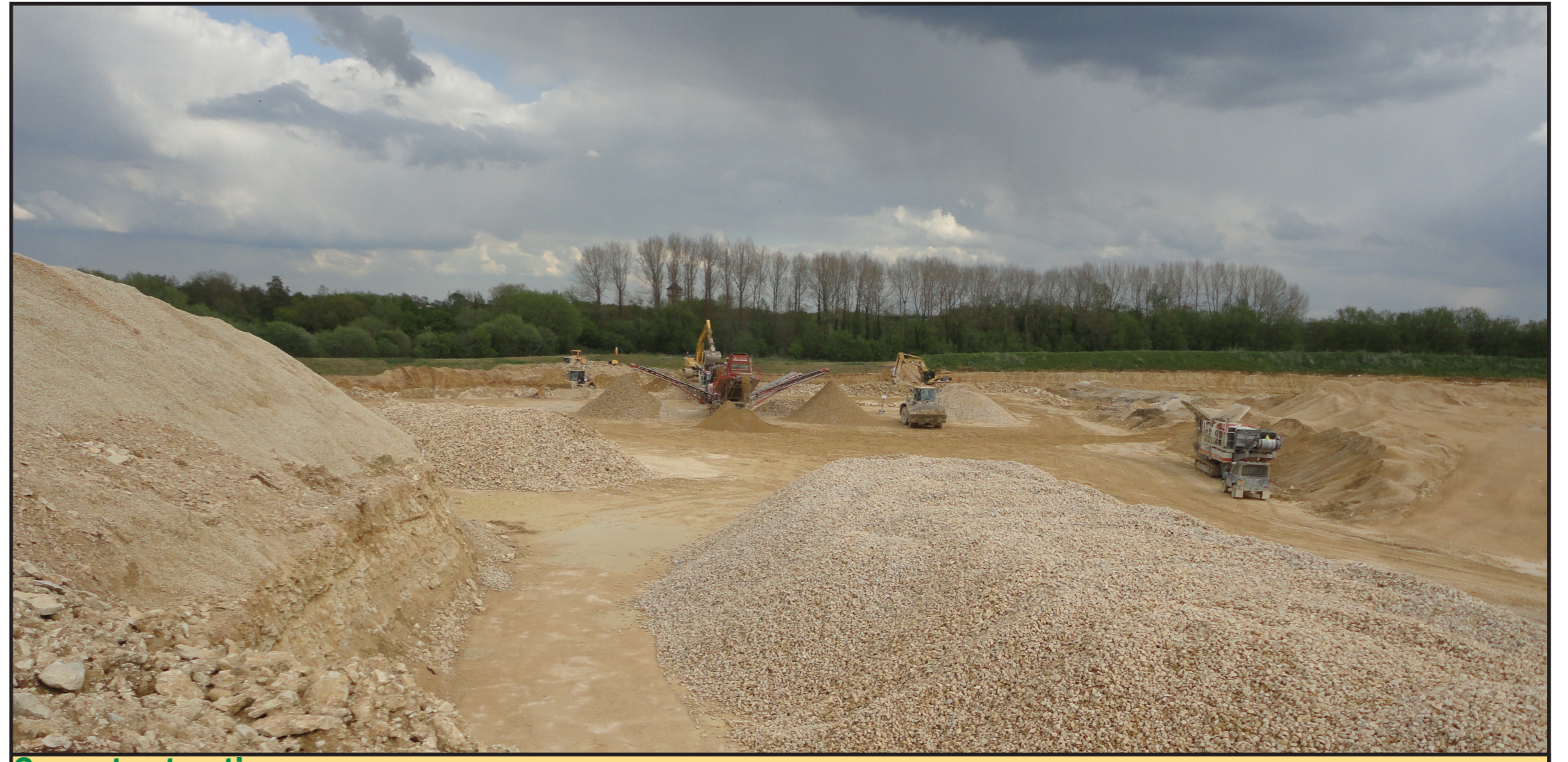
Current extraction area

As part of the design and planning process, Smiths wish to discuss their proposals for the site with the local community. This exhibition sets out to describe the proposals for the extension to Dewars Farm Quarry and provides an opportunity for communication and feedback from the local community, which will shape the design of the development.