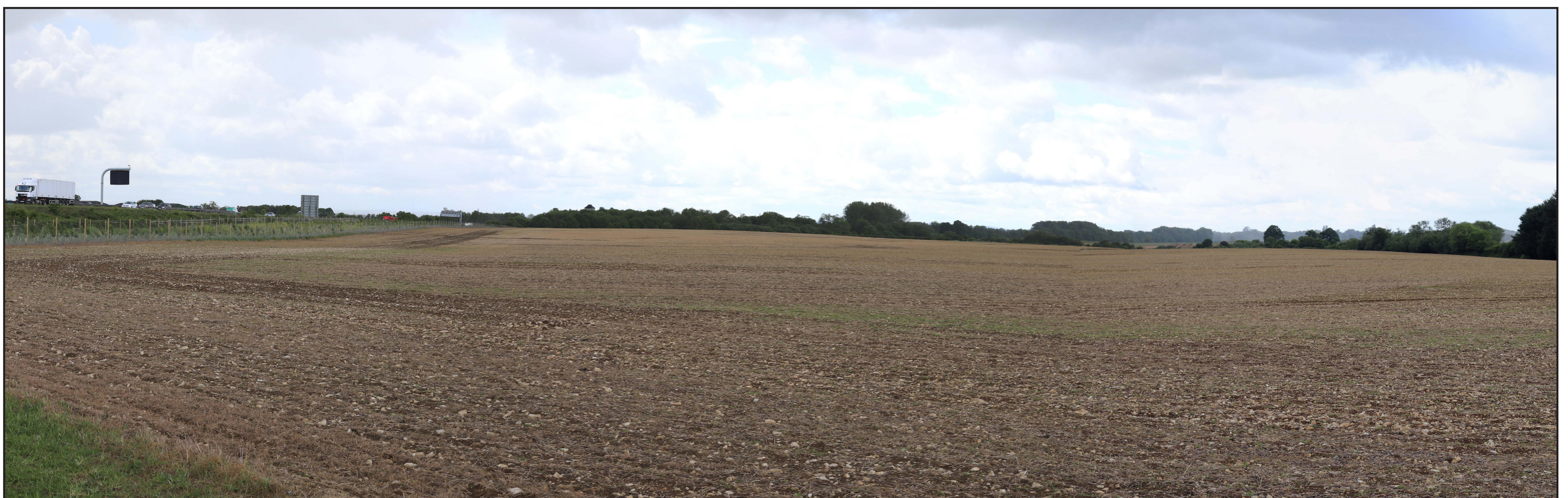
View of the proposed extension area from the northern site boundary (from the public footpath to the northern edge of the site)

Trow Pool Local Wildlife Site, is located to the south-east; Ardley Fields Quarry Local Wildlife Site, lies to the north-west; and Ardley Cutting and Quarry Site of Special Scientific Interest (SSSI) is located to the north and north-west.